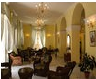
Hôtel Union Cienfuegos